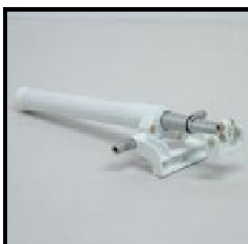
Screw Jack Opener