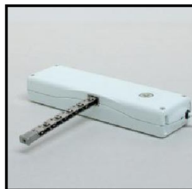
Electric Chain Opener