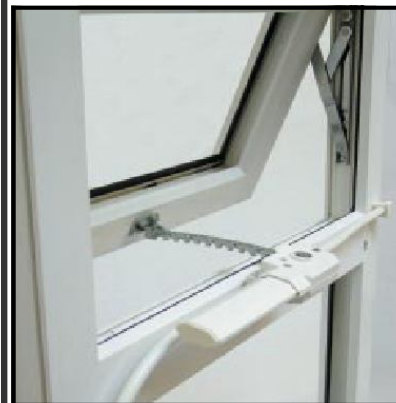
Manual Chain Opener

Please contact our sales office for full specification details