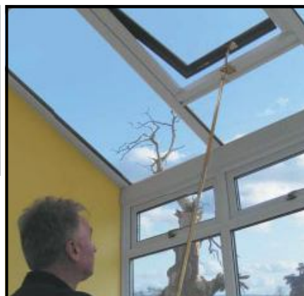
Screw Jack Opener (winding pole operated)

Please contact our sales office for full specification details